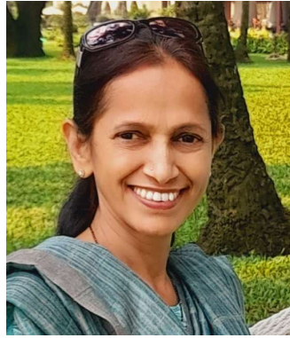
ACADEMIC Vice Principal

Welcome to Government College of Arts, Science and Commerce, Quepem, a place where your academic journey and personal growth take center stage.